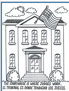
Illustration previously used for kindergarten and first grade students